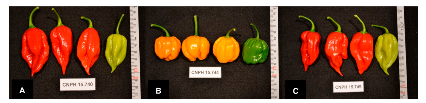
Figure 4. Fruit of the selected habanero lines CNPH 15.740 ( A ), CNPH 15.744 ( B ) and CNPH 15.749 ( C ) of Embrapa's breeding program.