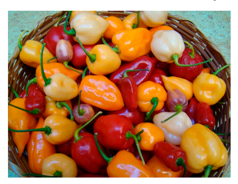
Figure 1. Sample of genetic variability maintained in the Embrapa's Capsicum germplasm bank.

Brazil, the Capsicum Germplasm Bank (GB), maintained by Embrapa Vegetables is the largest in South America and among the largest in the world, established almost four decades ago; currently it has about four thousand entries and holds five domesticated species and dozens of semidomesticated and wild species from different countries and different Brazilian regions [6]. This GB has served as the genetic basis for an ample genetic breeding program of Embrapa and partners in Brazil and abroad (Figure 1). In the breeding collection there are more than 30,000 lines and populations of domesticated and semi-domesticated species and dozens of cultivars of various types of spicy and low pungent peppers available to