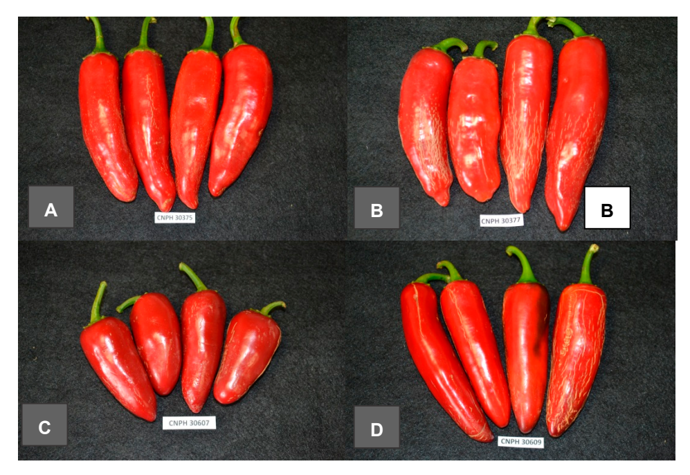
Figure 5. Fruit of selected jalapeño lines CNPH 30.375 ( A ), CNPH 30.377 ( B ), CNPH 30.607 ( C ) and CNPH 30.609 ( D ) of Embrapa's breeding program for mechanical harvesting.

high yield (>1 kg/plant), fruit pungency (>30,000 SHU) and concentrated fruit set. Four lines (CNPH 30.375; CNPH 30.777; CNPH 30.607 and CNPH 30.609) have been selected so far (Figure 5).