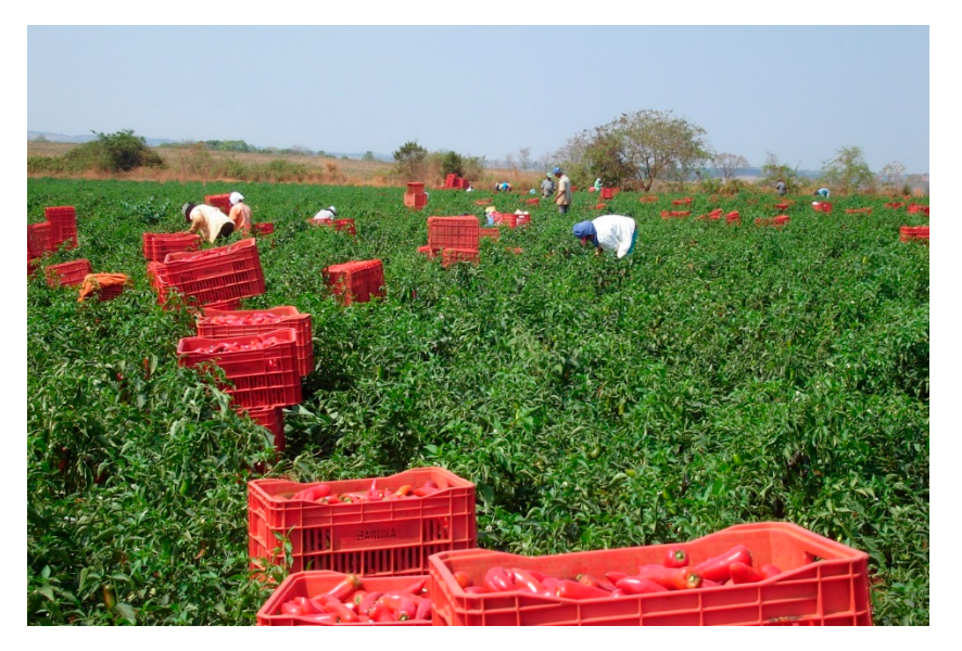
Figure 2. "BRS Sarakura" jalapeño pepper harvest in Catalão, Goiás, Brazil.

Today, one of the major challenges of Embrapa's partnership with the private sector is the development of jalapeño pepper cultivars adapted to mechanized harvesting. The lack of rural labor to harvest fruit is one of the biggest problems faced by Brazilian pepper farmers [27] and this has limited the expansion of industry and cultivation areas (Figure 2).