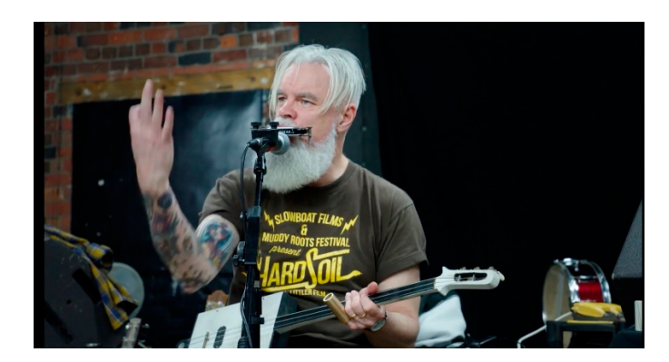
Figure 2. A still from the BBC Television Documentary "Cigar Box Blues: The Makers of a Revolution".

interviewed. This was not by choice, but because despite all efforts other female makers were not located. Taken along with the similarities of ages of those interviewed, this reinforced the initial view that this activity is largely dominated by middle-age men from a middle-class background.