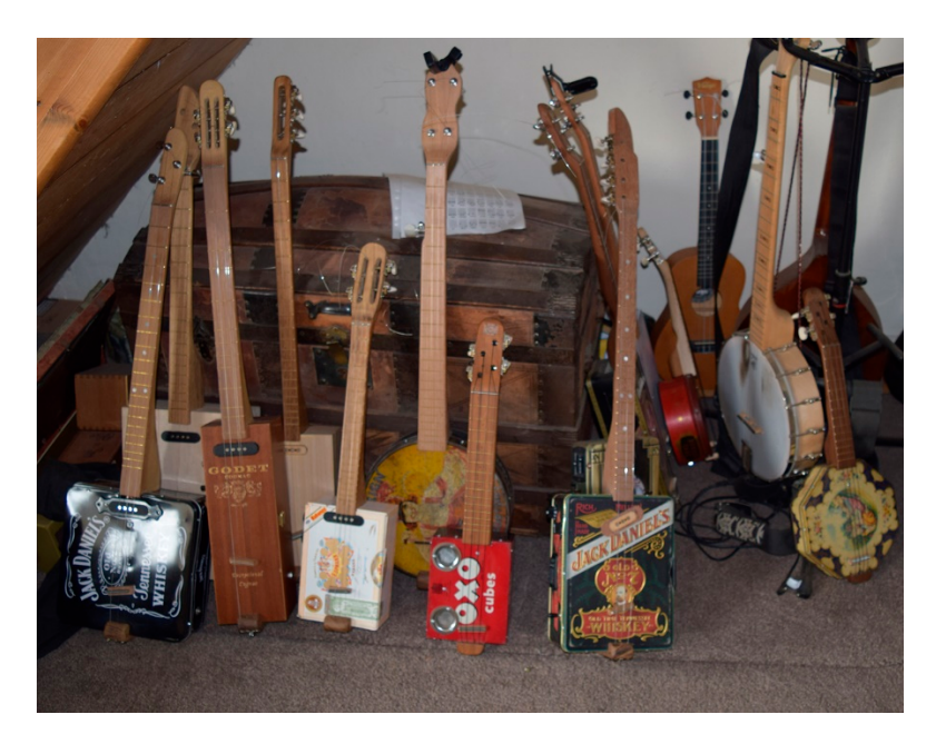
Figure 1. A selection of "cigar box guitars", canjos and ukuleles constructed from cigar boxes, various other wooden boxes and tin cans made to commission by Spatchcock and Wurzill.

presented as a reactionary object driven by a desire for an alternative to mainstream consumption. Citing frustration with the excessive costs of some factory-produced instruments from mainstream companies and the unnecessary exploitation of precious, unsustainable hardwood resources the "Cigar Box Guitar Revolution" encouraged people to reclaim used materials, make themselves such instruments and to get out and perform with them in public. The scene rapidly grew and now cigar box guitar festivals are held across the whole of the United States. When the American blues player "Seasick Steve" appeared on BBC television in 2006, his promotion of these instruments initiated the cigar box guitar scene in the UK.