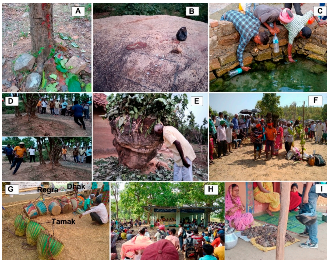
Figure 2. Rituals associated with Disom Sendra festival and sacred foci, (A) Place of worship of Sendra Bonga god, (B) Sita Panch , footprint of Sita cognized on a rock thereby, (C) Collecting sacred water by the Santals from the spring Sitakunda , (D) Ritual at Golbunum , (E) Worshipping Aten Dhiri , (F) Singrai dance performance during the festival, (G) Traditional instruments for amusement, (H) Gathering of Santals in Law-Bir-Bicy , Sutan Tandi ground, (I) Selling of medicinal plants by the locals during the festival.

The festivities depict the scope and opportunities of ethnotourism development centering the Disom Sendra festival of Ajodhya hills and can play the role of saviour protecting tribals' intangible heritage. The quantitative analysis through the IPA model reveals the top five attributes that have lodged the high mean scores as an indication of better performance status in the Disom Sendra festival among the fifteen selected attributes. These are "Social problem discussion and judgement